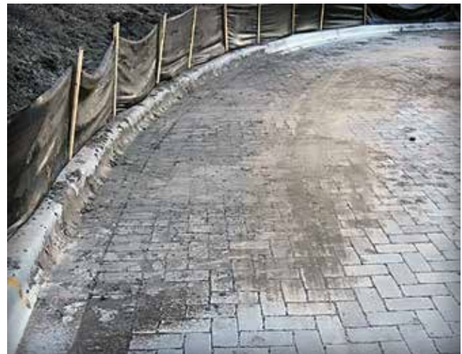
Figure 3. Whether eroded onto or dumped on PICP, erosion and sediment control are essential during construction.

Maintain filled joints with stones. The jointing stones capture sediment at the surface so it can easily be removed. If sediment is allowed to settle and consolidate, then cleaning becomes more difficult since the sediment is inside the joint rather than on the surface. Settlement of