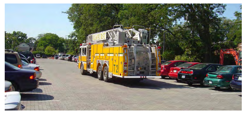
Figure 2. Parking lot in Elmhurst, IL.

PICP is used for walkways, driveways, parking lots, alleys, low-speed roads, and road shoulders. Figures 2, 3, and 4 illustrate vehicular applications. PICP is intended for areas with posted vehicle speeds no greater than 35 mph (50 kph). PICP is generally used in areas exposed to less than 1 million 80 kN lifetime equivalent single axle loads (ESALs; or Caltrans Traffic Index < 9). These applications use unstabilized open-graded aggregates. Open-graded bases stabilized with cement or asphalt, or the use of pervious concrete or porous asphalt bases, can provide higher lifetime ESALs; and accommodate heavier load applications. PICP has seen limited use in heavy load applications with permeable asphalt stabilized bases (Knapton 2003, Sieglen 2004). Design guidance for heavy loads can be found in overseas sources (Knapton 2007, 2012).