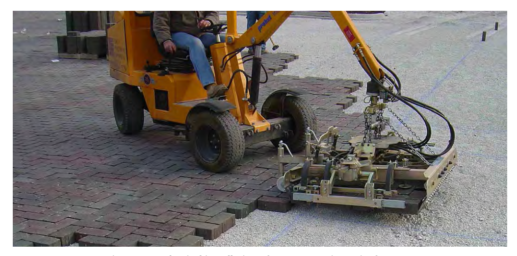
Figure 5. Mechanical installation of concrete paving units for PICP.

Most PICP projects are machine-installed to accelerate construction time over manual installation. Figure 5 illustrates a machine that lifts and places about a square yard (m²) of concrete pavers in their final laying pattern. The units are placed on the screeded bedding layer of aggregate, the joints are filled with aggregate, and the paver surface is swept clean and compacted.