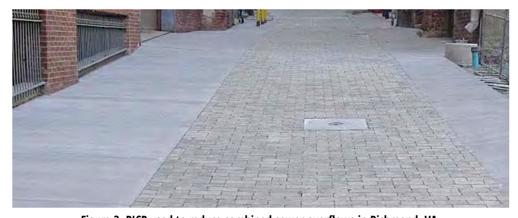
Figure 3. PICP used to reduce combined sewer overflows in Richmond, VA.