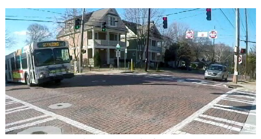
Figure 4. PICP streets in Atlanta, GA.

PICP should not be used in areas subject to loading/unloading or storage of hazardous materials. It is generally not placed in areas with high depth to seasonal water tables (i.e., less than 2 ft or 0.6 m), although it has been used in coastal areas with sandy soil subgrades in Maryland, Virginia, South Carolina, and Georgia. Like all permeable pavements, PICP should not be used on extremely dirty sites where there is uncontrolled waterborne sediment or windborne dust that can rapidly clog the surface.