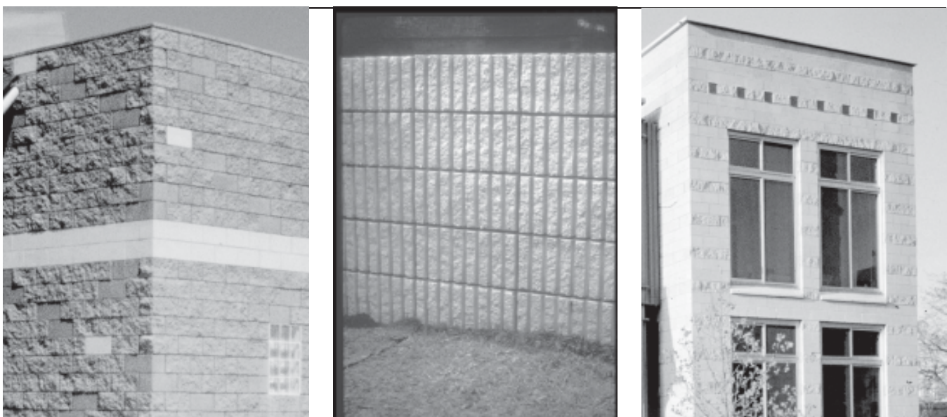
(a) Split Face and Glazed

Split-faced units can also be manufactured with ribs or scores to provide strong vertical lines in the finished wall. Rough textures, like those available with split face units, are often used in areas prone to graffiti, as the texture tends to discourage graffiti vandals.