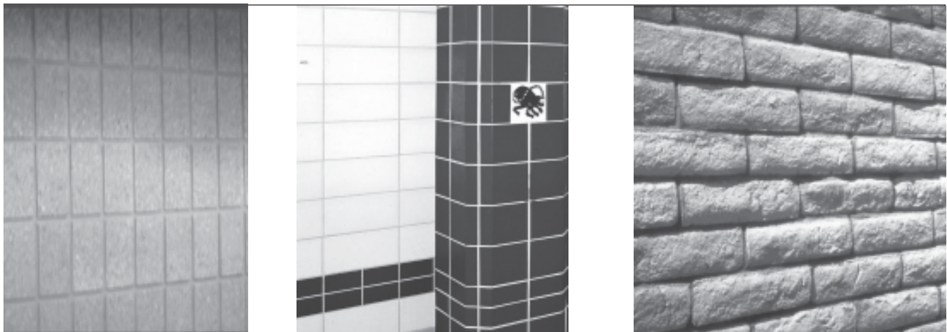
(a) Scored and Ground Face

Sand (or abrasive) blasting is used to expose the aggregate in a concrete masonry unit and results in a "weathered" look.